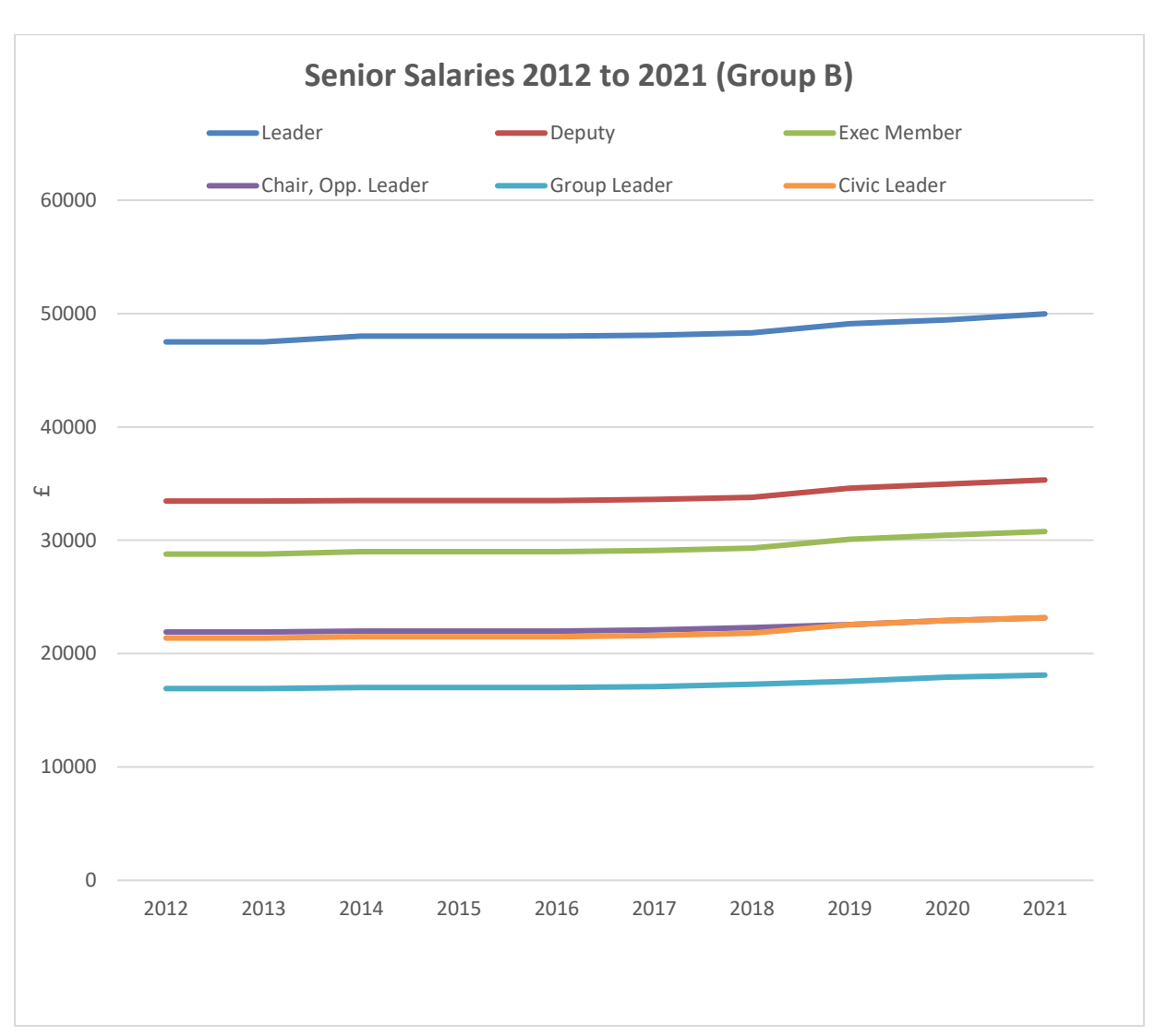
Graph 2: Senior salaries 2012 to 2021

3.7 The limit on the number of senior salaries payable ('the cap') will remain in place. In 2021/22 the maximum number of senior salaries payable within each council will not be altered and will be as set out in Table 2 below.